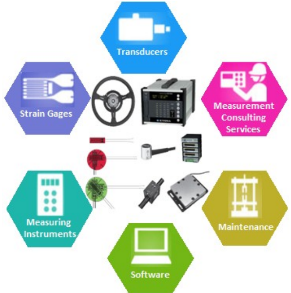
Kyowa make - Load Cells and Strain Gages