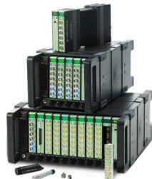
Data Acquisition System