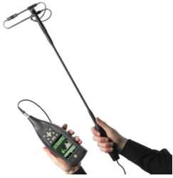
Hand Held Analyser