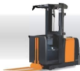
EKS (Vertical Order Picker)

Max. Capacity : 1200 kg Max. Pick Height : 11345 mm