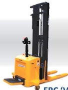
ERC 'V' (AC / DC) (Electric Stand-On Stacker)

Max. Capacity : 1700 kg Max. Lift : 6300 mm