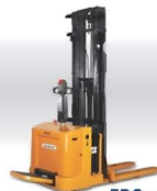
ERC (AC / DC) (Electric Stand-On Stacker)

Max. Capacity : 1700 kg Max. Lift : 6000 mm