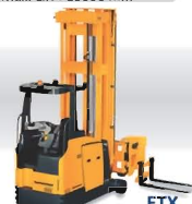
ETX (Tri-Lateral Stacker)

Max. Capacity : 1500 kg Max. Lift : 13000 mm