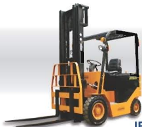
JFB (AC) (Electric Forklift)

Capacity : 1500 / 2000 / 2500 / 3000 kg Max. Lift : 6500 mm