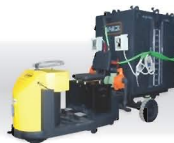
COOLANT COLLECTION TRUCK