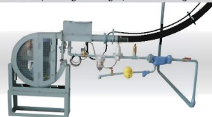
PSTS (Pneumatic Sample Transfer System)

Max. Sample Diameter - 58 mm / Max. Sample Weight - 500 gm / Max. Line Length - 2 km