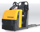
ECE (Horizontal Order Picker)

Max. Capacity : 2500 kg Max. Pick Height : 2nd level