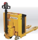
EJE (AC / DC) (Electric Pedestrian Pallet Truck)