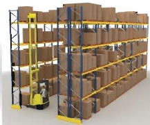
HEAVY DUTY JORACK