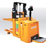
ERD (AC / DC) (Electric Stand-On Double Pallet Truck)