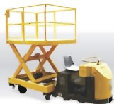
SEAT-ON VEHICLE MOUNTED SCISSOR LIFT