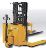
EJB (AC / DC) (Electric Pedestrian Staddle Stacker)

Max. Capacity : 1700 kg Max. Lift : 6300 mm