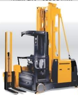
EKX (Order Picker / Tri-Lateral Stacker)

Max. Capacity : 1500 kg Max. Lift : 16500 mm