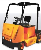
TUSKER (AC / DC) (Tow Truck)