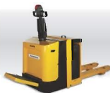
ERE (AC / DC) (Electric Stand-On Pallet Truck)