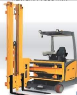
EFX (Tri-Lateral Stacker)

Max. Capacity : 1250 kg Max. Lift : 7000 mm