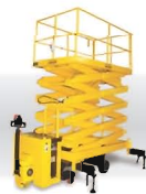
PEDESTRIAN VEHICLE MOUNTED SCISSOR LIFT