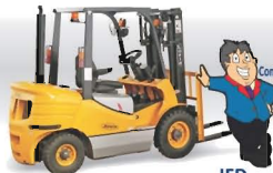
JFD (Diesel Forklift)

Max. Capacity : 3000 kg Max. Lift : 6000 mm