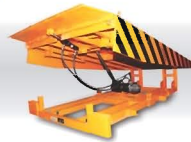
Dock Leveler (Electric Hydraulic Dock Leveler)