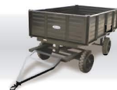
BAGGAGE TROLLEY WITH SIDE FLAP