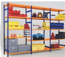
LIGHT DUTY JORACK