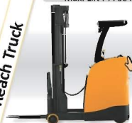
REACH TRUCK (Electric Reach Truck)

Max. Capacity : 1600 kg Max. Lift : 7700 mm