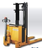
EJC (AC / DC) (Electric Pedestrian Stacker)

Max. Capacity : 1700 kg Max. Lift : 6300 mm