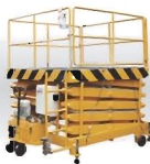
MOBILE SCISSOR LIFT

Max. Capacity : 2000 kg Max. Lift : 14000 mm