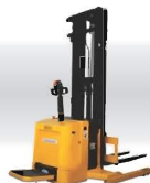
ERB (AC / DC) (Electric Stand-On Staddle Stacker)

Max. Capacity : 1700 kg Max. Lift : 6300 mm